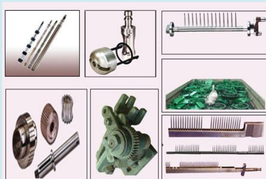
Range of spares for preparation spinning & drawing