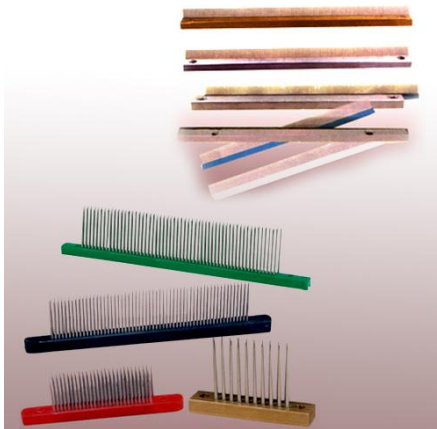
GILLS & HACKLES FOR FLAX SPINNING